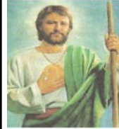
Novena to St. Jude

Novena a San Judas Tadeo continua todos los días hasta el 28 Octubre en la Capilla a las 6 p.m.