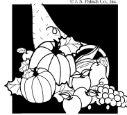
Día de Acción de Gracias