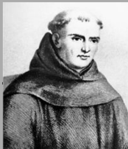
Padre Junípero Serra